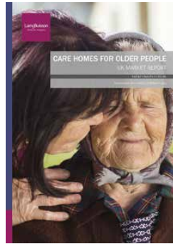
Care Homes for Older People