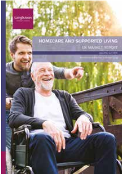
Homecare and Supported Living