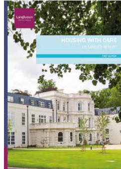
Housing with Care