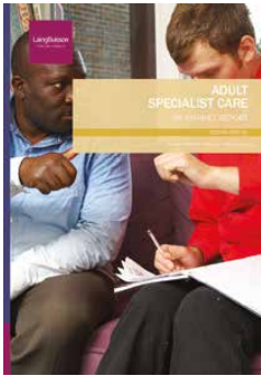
Adult Specialist Care