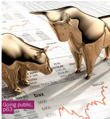
Going public, p63