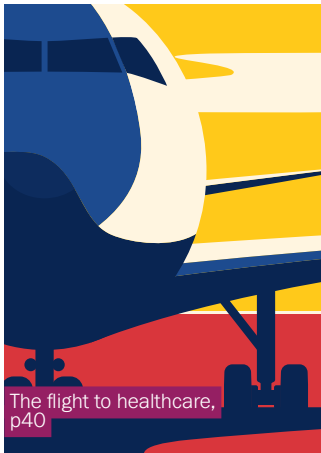
The flight to healthcare, p40